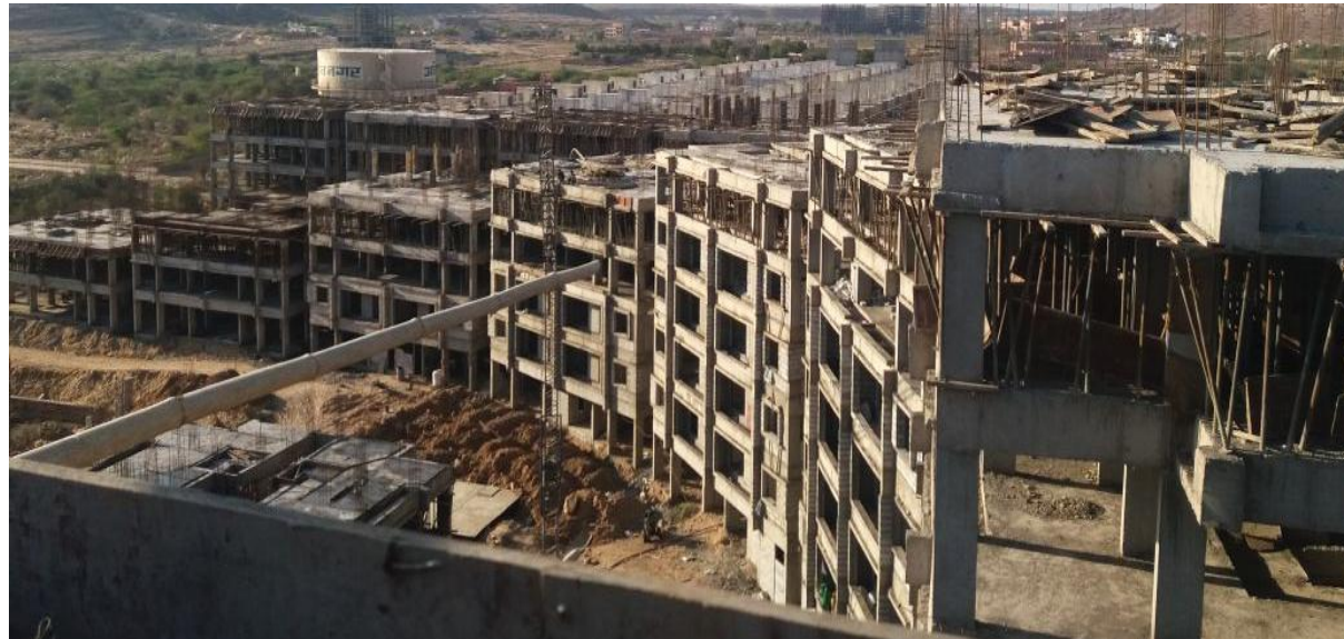
ARIHANT AANCHAL (FEBRUARY 2018)