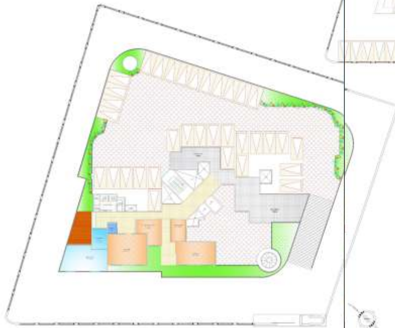
PODIUM FLOOR PLAN